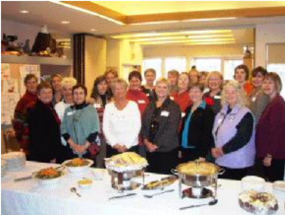
South Island Region luncheon at Swan Lake Nature House.